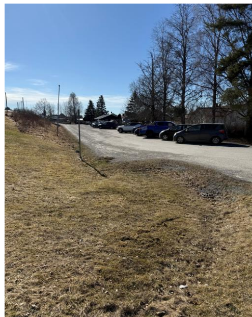
The venue hall and parking places.